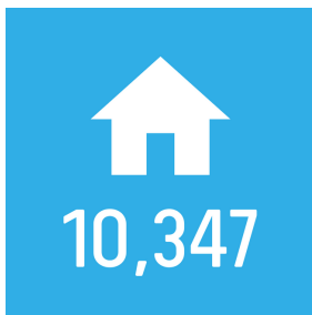
in cases involving housing security / loss of home