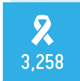
in cases involving domestic violence