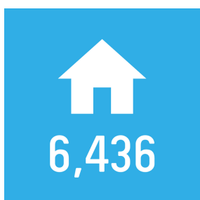
in cases involving housing security / loss of home