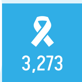
in cases involving domestic violence