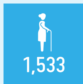
in cases involving seniors